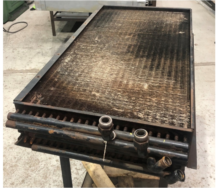
Original LX230 Oil Cooler