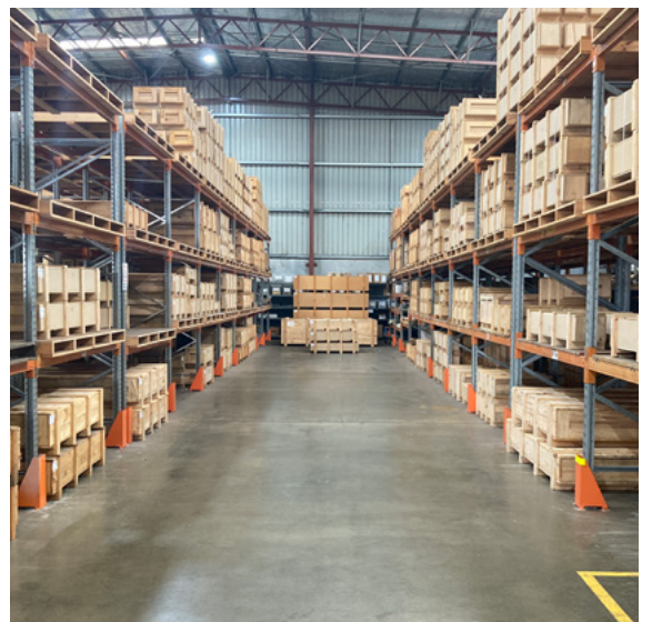
Portion of Cooler and Core Stock

By keeping the manufacturing process entirely in-house, the COR Rapid service offerings are complete and delivered within an expedited time frame over traditional model inventory. This means our customers receive their required components in a more timely manner, reducing machine downtime while increasing cooler performance as all COR Rapid products benefit from our COR Cooling™ Bar and Plate design enhancements.