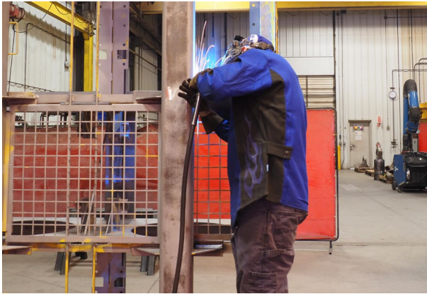
In House Remanufacturing