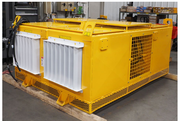
Fully Remanufactured KOM 930E Grid Box

H-E Parts International replacement parts are compatible with the makes and/or models of the third-party equipment described. H-E Parts International is not an authorized repair facility of these third parties and it does not have an affiliation with any manufacturers of these third-party products. All brands, original equipment manufacturer (OEM) part numbers or references are owned by the respective OEM entities or their affiliates. These terms are used by H-E Parts International for identification and cross reference purposes only and are not intended to indicate affiliation with, or approval by the OEM, of H-E Parts International or its products.