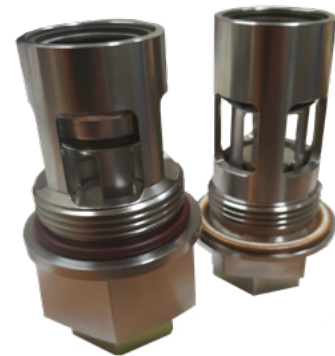
Birrana™ BEST Plug

The Birrana™ oil sampling plug allows oil samples to be taken when the plug is above or below the oil level. Samples can be taken with the level port positioned anywhere between 30° and 330°, greatly reducing the need to move the truck to position the plug just above the oil level to take the oil sample. This saves time and money during the oil sampling process.