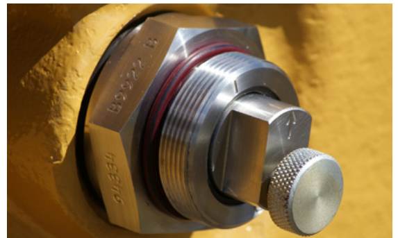
Birrana™ Oil Sampling Plug